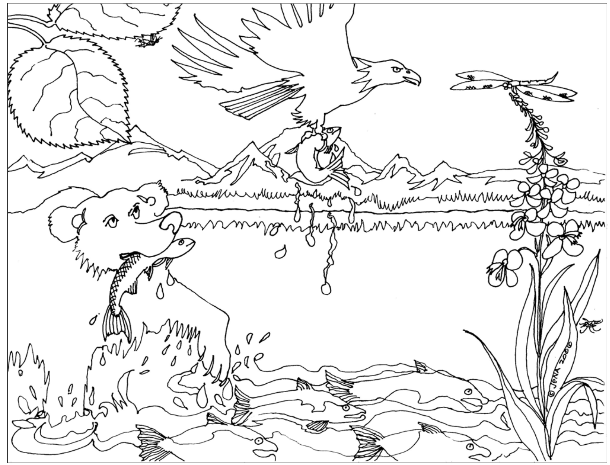
The beautiful and wild Copper River begins in Wrangell- St. Elias National Park.