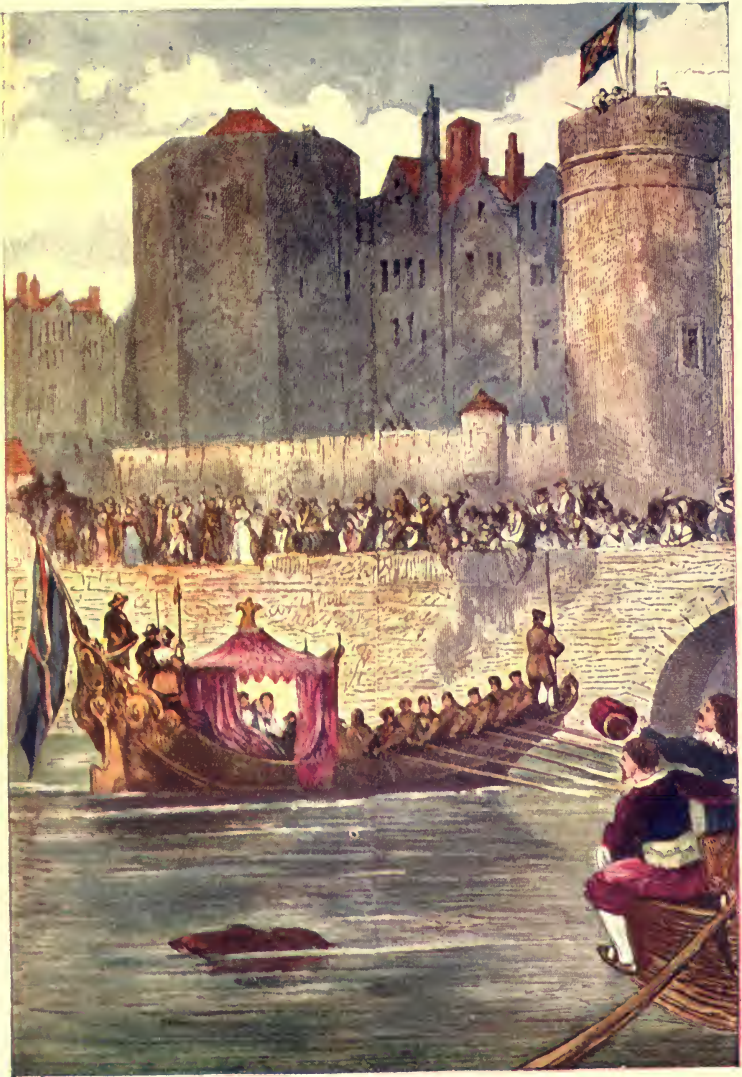
THE BISHOPS SENT TO THE TOWER.