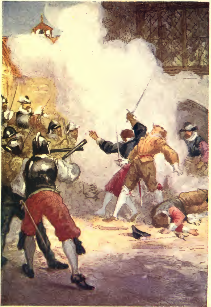
THE END OF THE GUNPOWDER CONSPIRACY.