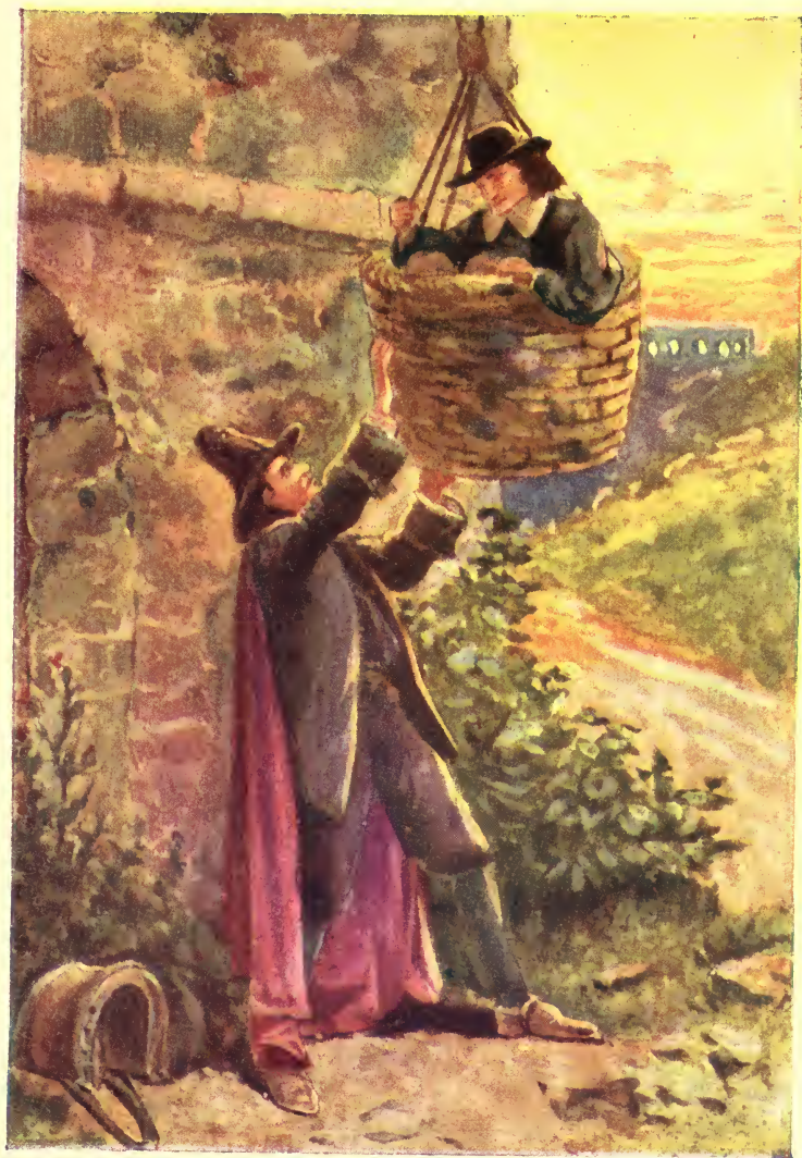
BONNEVAL'S ESCAPE FROM THE DRAGOONS.