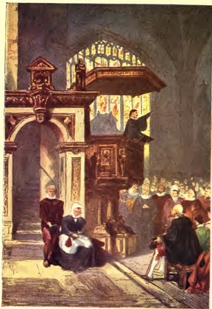
A PROTESTANT SERVICE IN THE NETHERLANDS.