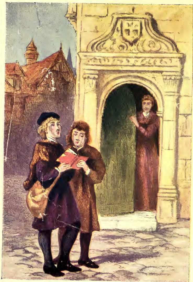
YOUNG LUTHER SINGING BEFORE THE HOUSE OF URSULA COTTA.