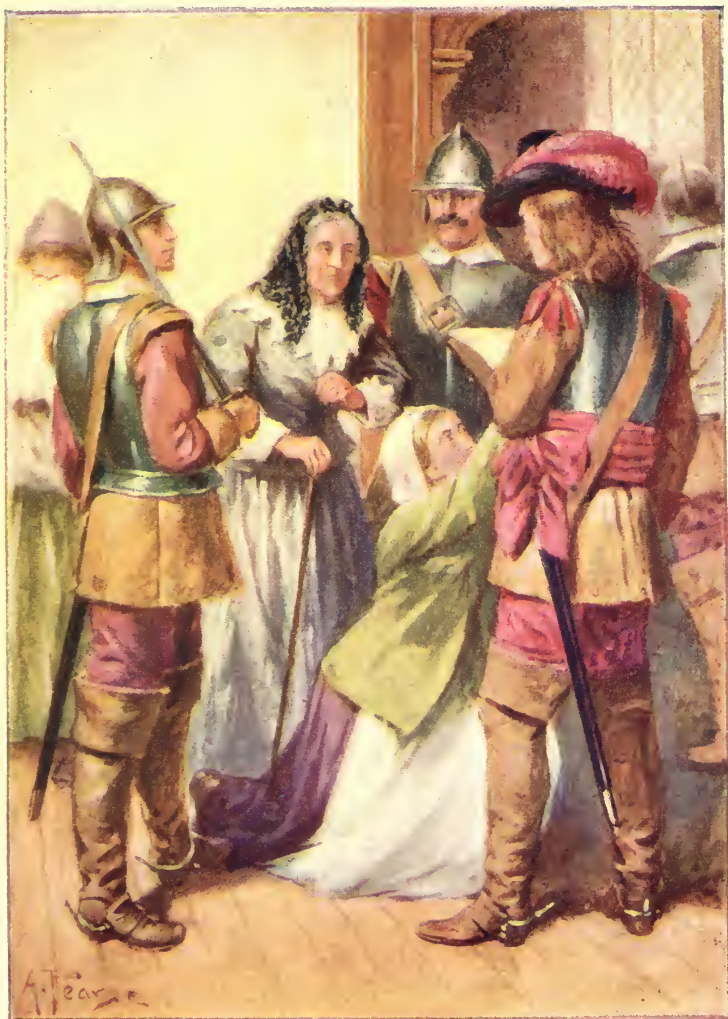
THE ARREST OF LADY ALICE LISLE.