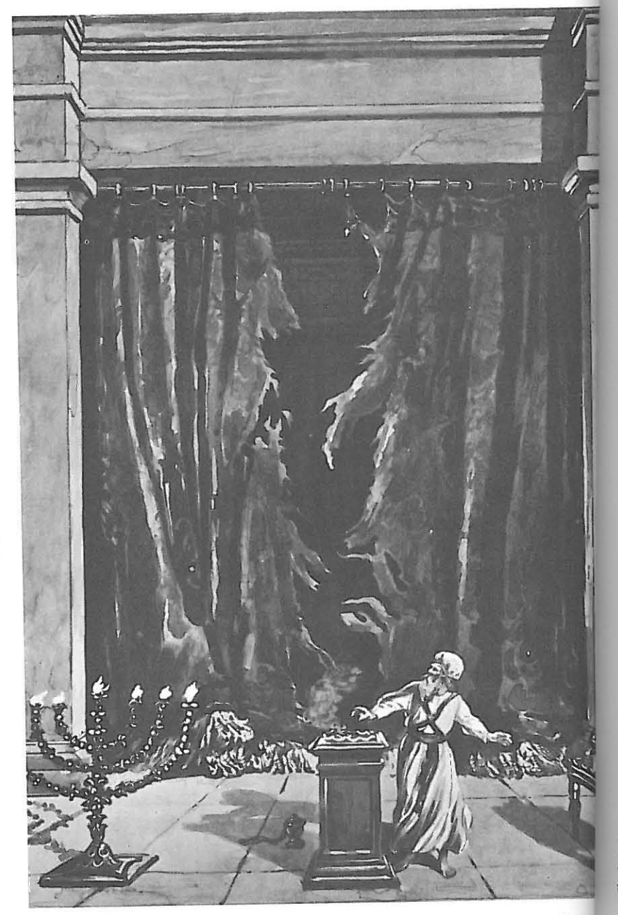
WHAT IS THE SANCTUARY?

from top to bottom by unseen hands. (Matthew 27:51.) This was to show that the service of God in this earthly Temple had come to an end. This beautiful structure remained standing until A.D. 70, when it was completely destroyed by the Romans. But it ceased to be the sanctuary of God when the great Sacrifice was offered on Calvary's cross, and the dispensation of types came to an end.